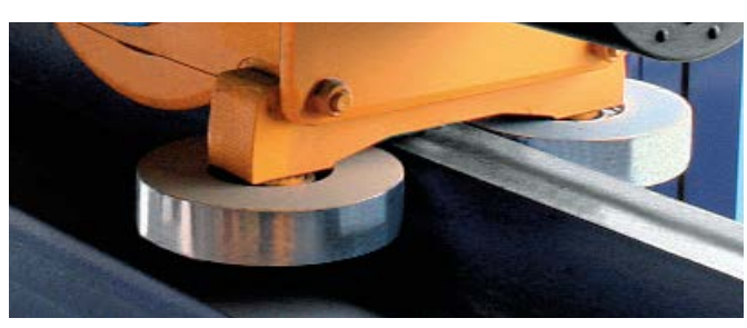
Guide rollers on the high level crane rail