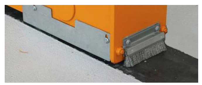
Floor rollers without guide rails